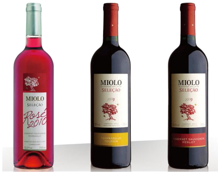
Rosé Cabernet Sauvignon / Tempranillo